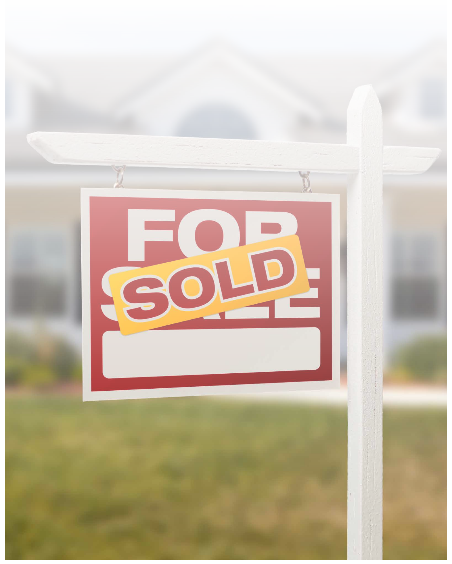
11/2018 | © Old Republic Title | The named agent above is a policy-issuing agent for Old Republic Title. Old Republic Title's underwriters are Old Republic National Title Insurance Company and American Guaranty Title Insurance Company | Old Republic Title is providing this information as a free customer service and makes no warranties or representations as to its accuracy. Old Republic Title strongly recommends that consumers confer with their title insurer as underwriting requirements vary among companies and further, obtain guidance and advice from qualified professionals, including attorneys specializing in Real Property, Trusts and/or Title Insurance to get more detailed, and current, information as to any particular situation affecting them. | EZM_HB_0077_H1